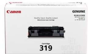
CART319 – 2100 page yield