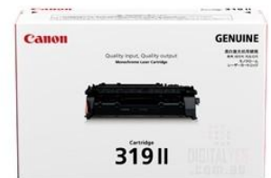
CART319II – 6400 page yield